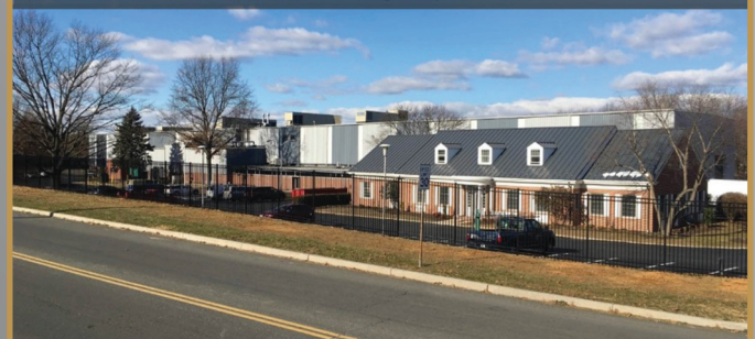
Dolan Construction Inc. Alcon Precision Device Facility Expansion