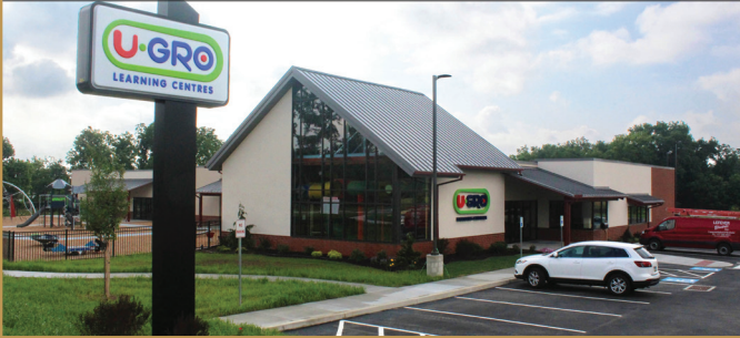
Wohlsen Construction Company U-GRO Learning Centre - Rohrerstown