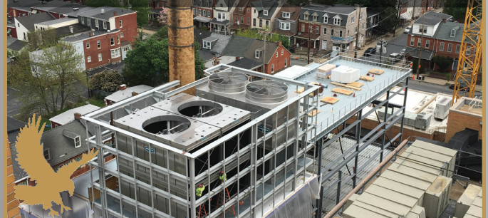
James Craft & Son, Inc. Lancaster General Health - Energy Center