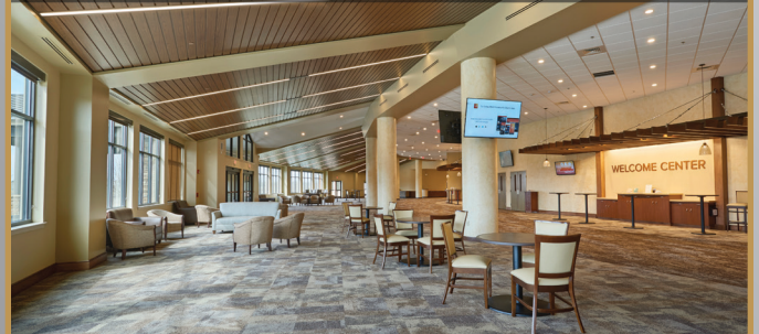
Smucker Company Living Word Community Church Renovation and Expansion