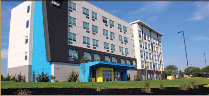
Wohlsen Construction Company Tru Hotel - Lancaster