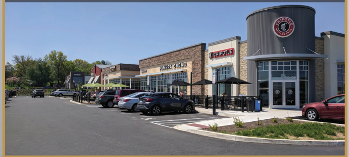
Wohlsen Construction Company Lime Spring Square