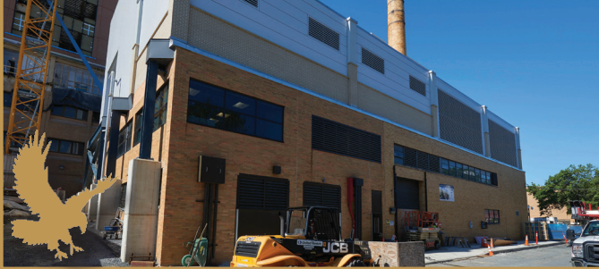
Benchmark Construction Company, Inc. Tri-Generation Plant Overbuild