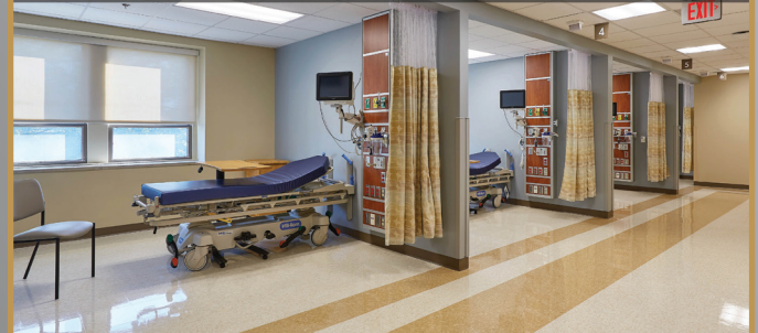
Benchmark Construction Company, Inc. Pre & Post Op Renovation