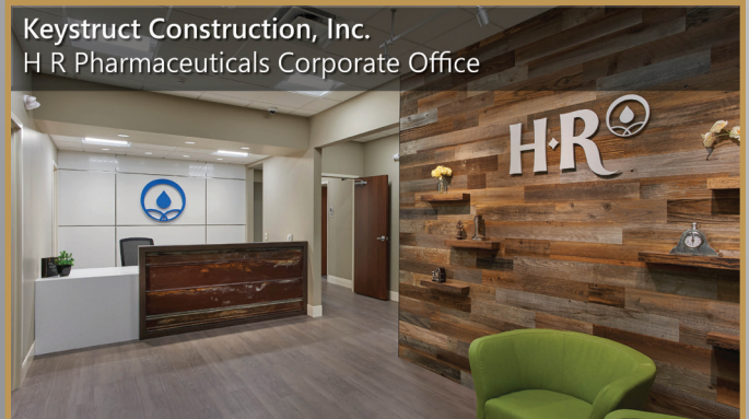
Keystruct Construction, Inc. H R Pharmaceuticals Corporate Office