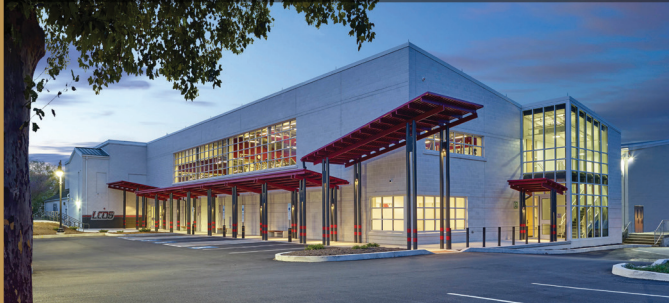
Wohlsen Construction Company Physical Education & Athletic Center