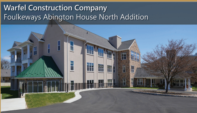
Warfel Construction Company Foulkeways Abington House North Addition