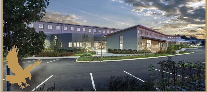
Warfel Construction Company Aerzen USA Headquarters Expansion