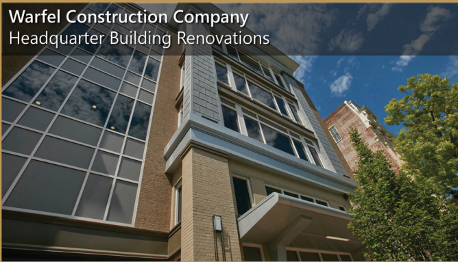
Warfel Construction Company Headquarter Building Renovations