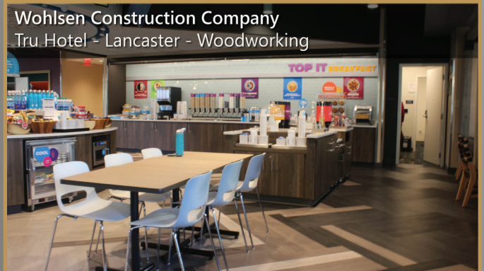
Wohlson Construction Company Tru Hotel - Lancaster - Woodworking