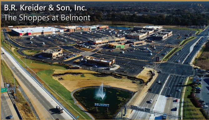
B.R. Kreider & Son, Inc. The Shoppes at Belmont