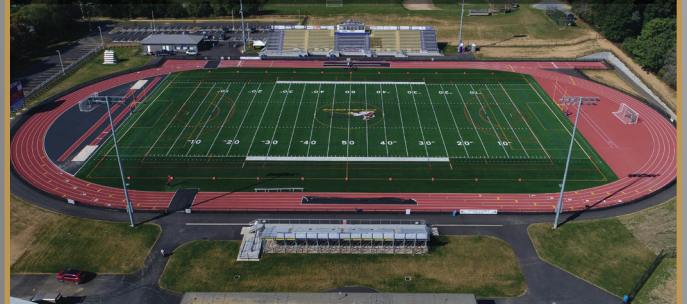
Warfel Construction Company Lancaster Catholic High School Stadium