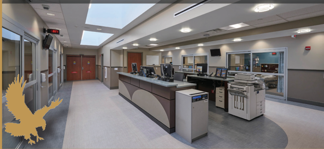
Benchmark Construction Company, Inc. Cardio Overbuild