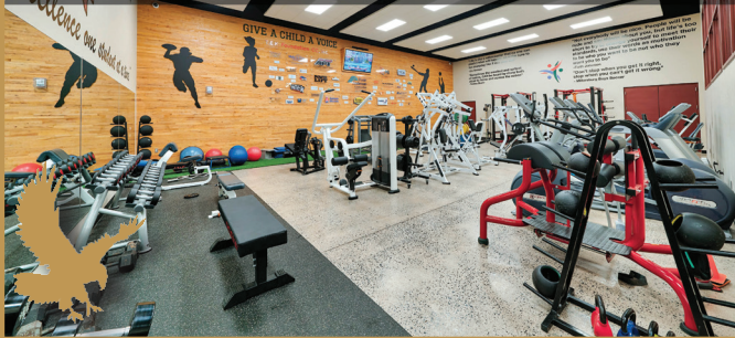
Poole Anderson Construction Give a Child a Voice Fitness Center