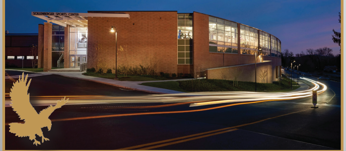
Wohlsen Construction Company Sollenberger Sports Center