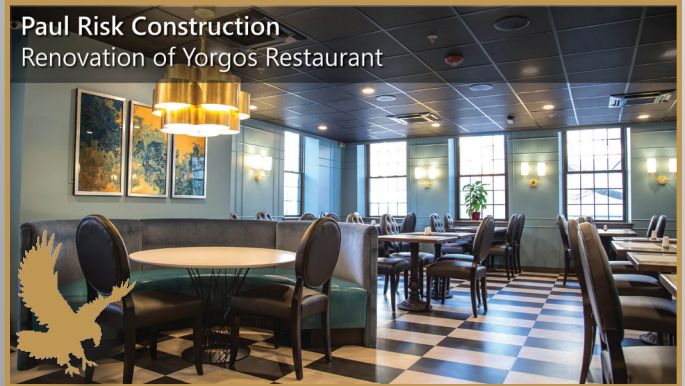
Paul Risk Construction Renovation of Yorgos Restaurant