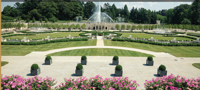
B.R. Kreider & Son, Inc. Longwood Gardens - Main Fountain Garden