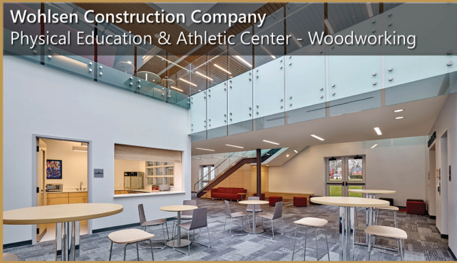
WOODWORKING UNDER $150,000