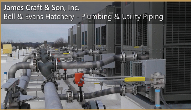
James Craft & Son, Inc. Bell & Evans Hatchery - Plumbing & Utility Piping