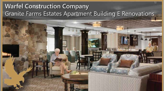
Warfel Construction Company Granite Farms Estates Apartment Building E Renovations