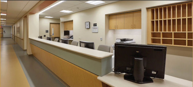
Benchmark Construction Company, Inc. 5th Floor Patient Rooms