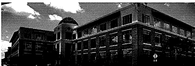
(3 story office building features architectural domes, decorative canopies, Viracon reflective glass, cast stone and brick veneer)

exterior. The interior of the office building has travertine tile floors custom quarried in Spain and handcrafted light fixtures. Also, the office has a state of the art computerized 42" touch-screen directory, mechanical energy management, building automation system, and a controlled-access system to facilitate off-site property management.